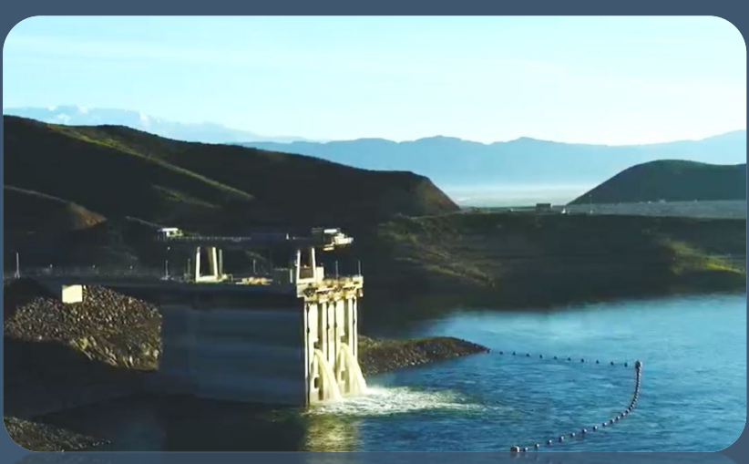
SoCal refills its largest reservoir for the first time in three years.